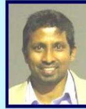
Russel Arnold Batting