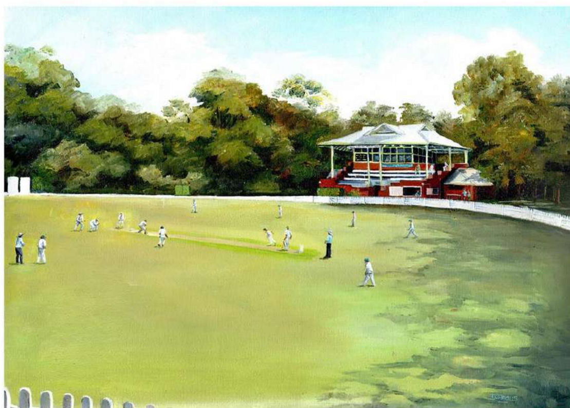
OLD KINGS OVAL - PARRAMATTA PARK

Proceeds from the sale of the limited edition Old Kings Oval Prints will go towards the construction of a new electronic scoreboard at Old Kings Oval and will be named the Benaud Scoreboard.